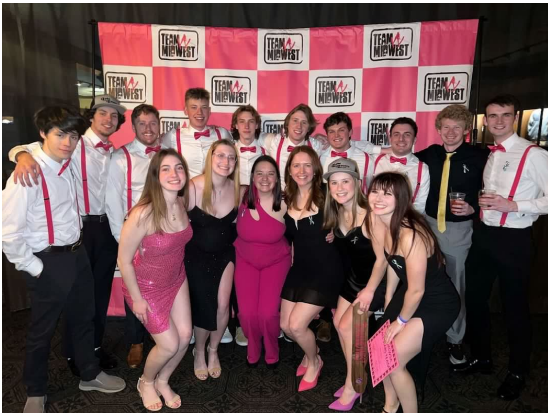
Michigan State University and Western Michigan University