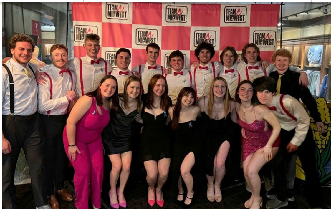
Michigan State University and Western Michigan University