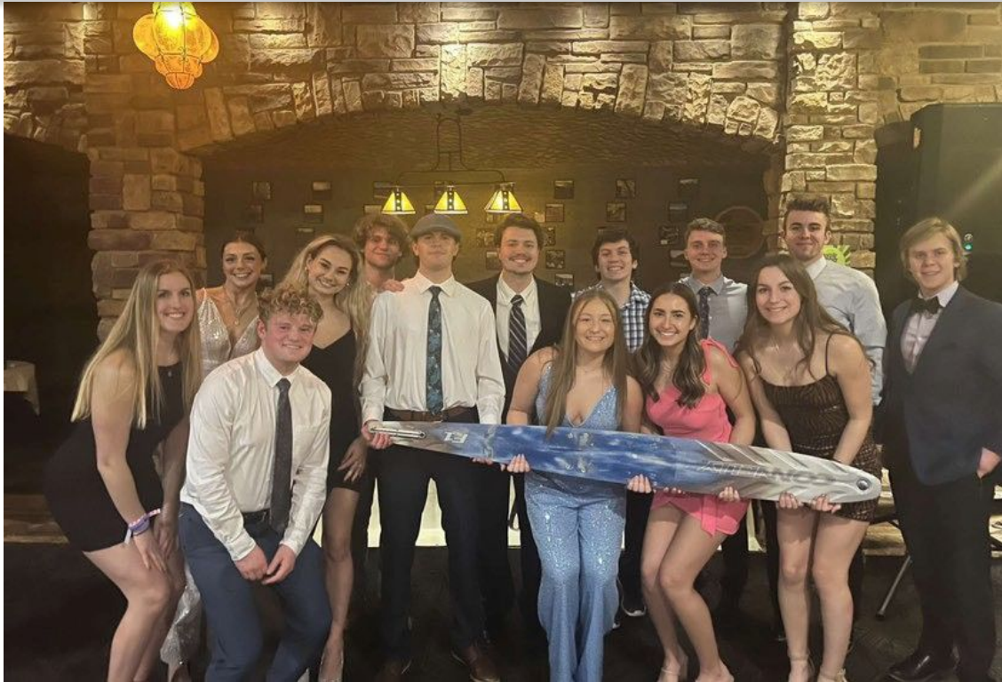
Grand Valley State University